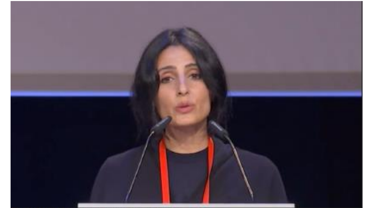
Razan al Mubarak, IUCN President-Elect